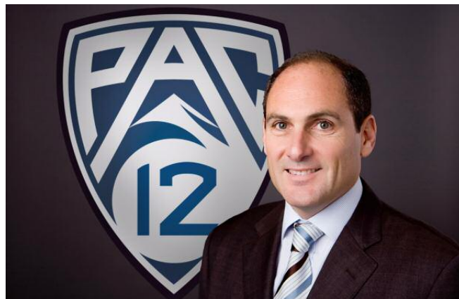
Pac-12 Commissioner Larry Scott

Pac-12 women student-athletes shine nationally on an individual basis, as well, having captured an unmatched 701 NCAA individual crowns, an average of nearly 21 championships per season.