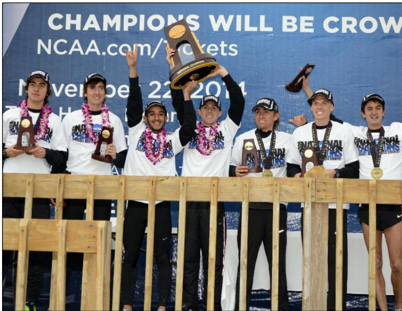
CU claimed its second straight NCAA cross country title in November 2014

The Pac-12 Conference offices are located in the heart of San Francisco in the SOMA district.